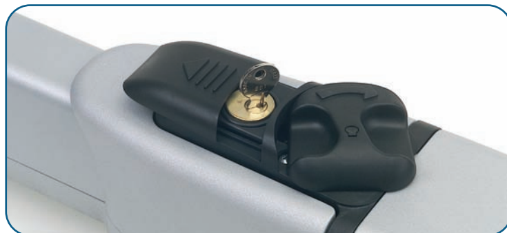
Manual release Mechanism

*with leaves exceeding 3 m the fitting of an electric lock is required to ensure the leaf locking