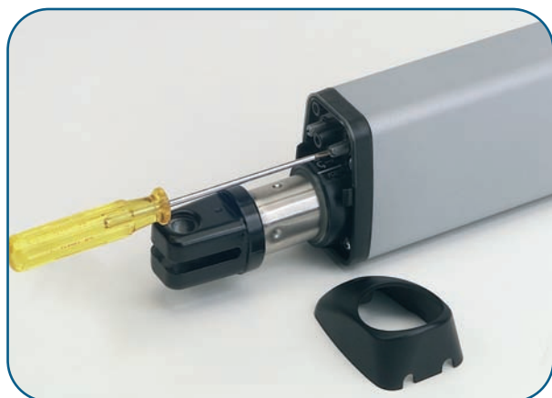
Limit Switch Adjustment